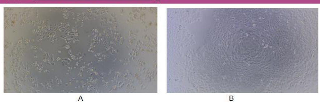
Figure 1. Inhibition of HepG2 cells proliferation after stimulated with recombinant chicken BMP4