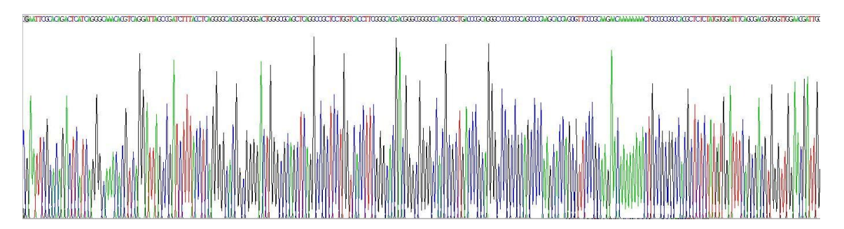
Figure 3. Gene Sequencing (extract)