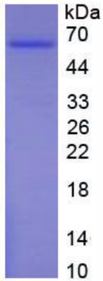
Figure 2. SDS-PAGE