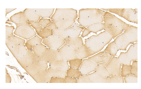
DAB staining on IHC-P;

Western Blot; Sample: Lane1: Rat Heart lysate; Lane2: Porcine Heart lysate; Lane3: Porcine Skeletal muscle lysate; Lane4: MCF7 cell lysate Primary Ab: 3?g/ml Mouse Anti-Human H-FABP Antibody Second Ab: 0.2µg/mL HRPLinked Caprine Anti-Mouse IgG Polyclonal Antibody (Catalog: SAA544Mu19)