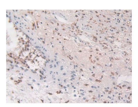
DAB staining on IHC-P; Sample: Human Appendix Tissue; Primary Ab: 30µg/ml Mouse AntiHuman MIP3a Antibody Second Ab: 2µg/mL HRP-Linked Caprine Anti-Mouse IgG Polyclonal Antibody (Catalog: SAA544Mu19)