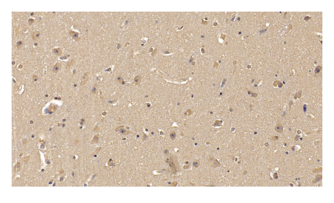
DAB staining on IHC-P; Samples: Human Cerebrum Tissue; Primary Ab: 10µg/ml Mouse Anti-Human MMP25 Antibody Second Ab: 2µg/mL HRPLinked Caprine Anti-Mouse IgG Polyclonal Antibody (Catalog: SAA544Mu19)