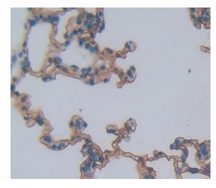
Used in DAB staining on fromalin fixed paraffin- embedded lung tissue