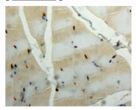
Used in DAB staining on fromalin fixed paraffin-embedded muscle tissue