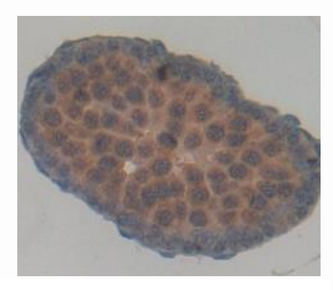
Used in DAB staining on fromalin fixed paraffin- embedded testis tissue