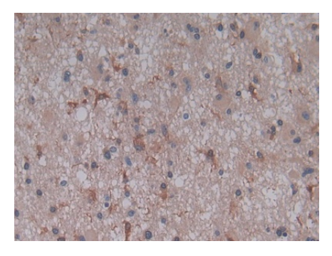
DAB staining on IHC-P; Samples: Human Glioma Tissue; Primary Ab: 30µg/ml Rabbit AntiHuman C5a Antibody Second Ab: 2µg/mL HRP-Linked Caprine Anti-Rabbit IgG Polyclonal Antibody (Catalog: SAA544Rb19)

Western Blot; Sample: Human Serum Primary Ab: 1?g/ml Rabbit Anti-Human C5a Antibody Second Ab: 0.2µg/mL HRP-Linked Caprine Anti-Rabbit IgG Polyclonal Antibody (Catalog: SAA544Rb19)