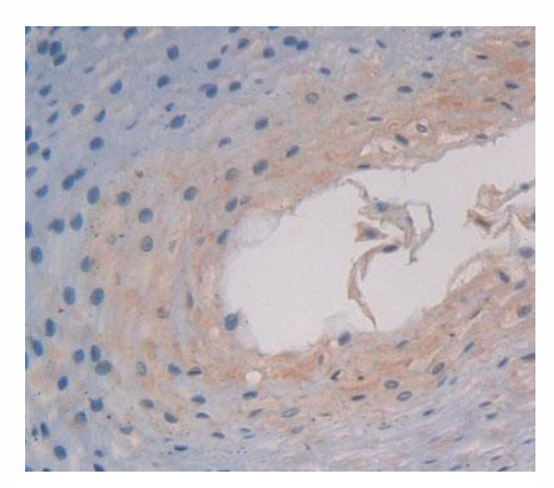
Used in DAB staining on fromalin fixed paraffin- embedded esophagus tissue