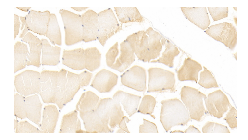
DAB staining on IHC-P;