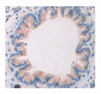
Used in DAB staining on fromalin fixed paraffin- embedded lung tissue

Used in Western Blot, Sample: Recombinant EGFR2, Rat