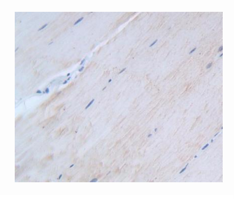
Used in DAB staining on fromalin fixed paraffin- embedded skeletal muscle tissue