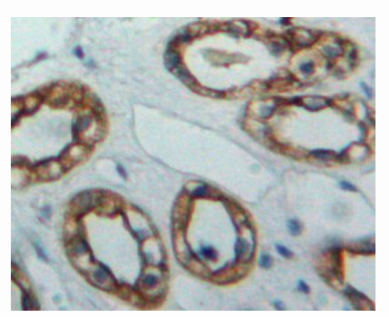
Used in DAB staining on fromalin fixed paraffin-embedded Kidney tissue