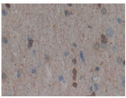
DAB staining on IHC-P; Samples: Human Cerebrum Tissue; Primary Ab: 10µg/ml Rabbit AntiHuman MAPK11 Antibody Second Ab: 2µg/mL HRP-Linked Caprine Anti-Rabbit IgG Polyclonal Antibody (Catalog: SAA544Rb19)