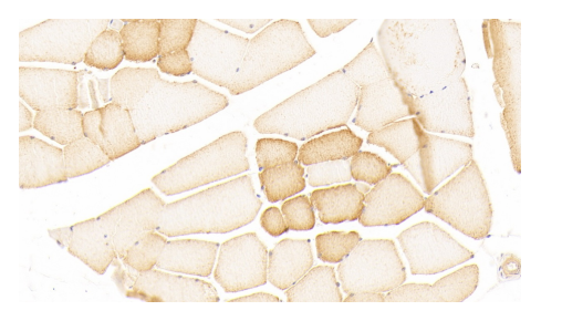
DAB staining on IHC-P; Samples: Human Skeletal muscle Tissue; Primary Ab: 20?g/ml Rabbit Anti-Human NMU Antibody Second Ab: 2µg/mL HRP-Linked Caprine Anti-Rabbit IgG Polyclonal Antibody (Catalog: SAA544Rb19)