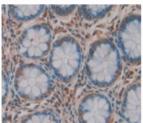
Used in DAB staining on fromalin fixed paraffin- embedded rectum tissue

Used in Western Blot, Sample: Recombinant S100A16, Human