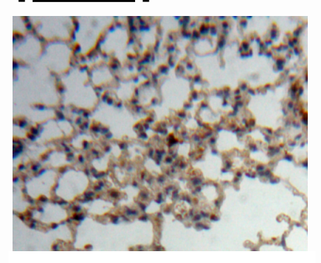
Used in DAB staining on fromalin fixed paraffin- embedded Lung tissue