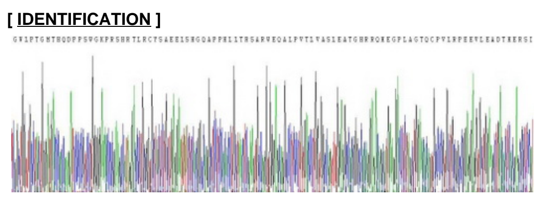
Figure . Gene Sequencing (extract)

GWLP TGMTHQDPPS WGKPRSHRTL RCYSAEELSH GQAPPHLLTR SARWEQALPV ALVASLEATG HRRQHEGPLA GTQCPVLRPE EVLEADTHER SISPWRYRID TDENRYPQKL AVAECLCRGC INAKTGRETA ALNSVQLLQS LLVLRRQPC