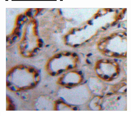
Used in DAB staining on fromalin fixed paraffin- embedded kidney tissue