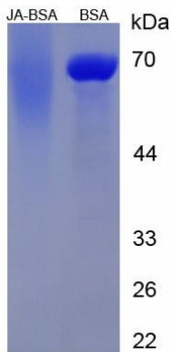
Figure 1. SDS-PAGE