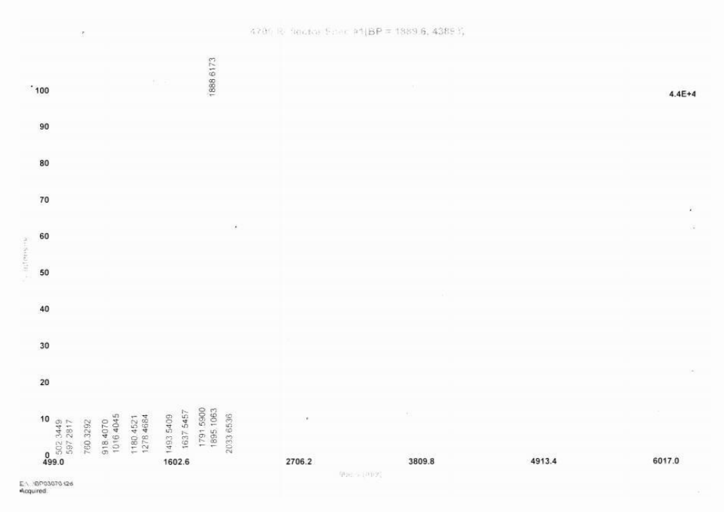
Figure 2. MASS Spectrometry of the Original Peptide