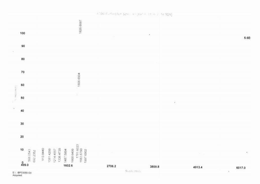
Figure 2. MASS Spectrometry of the Original Peptide